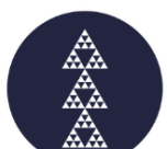
NIHO TANIWHA TEAM