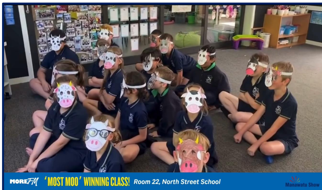
MORE FM 'MOST MOO' WINNING CLASS! Room 22, North Street School