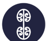
TE ARA MANGOPARE TEAM