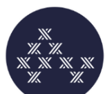
PURAPURA WHETU TEAM