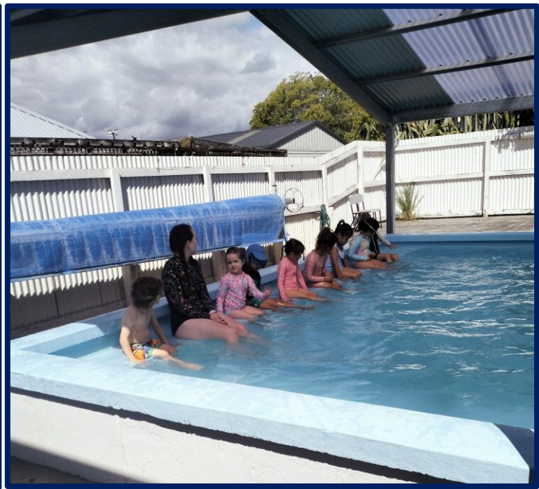
Rm 19 are developing their confidence in the water and making the most of our school pool!