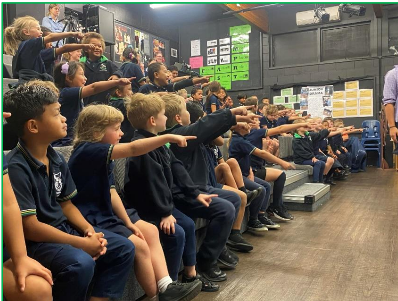
Today our year 1/2 tamariki went to a clown show hosted by Feilding High School drama students. We had a lot of fun, and a lot of laughs! Thanks you FAHS for inviting us!