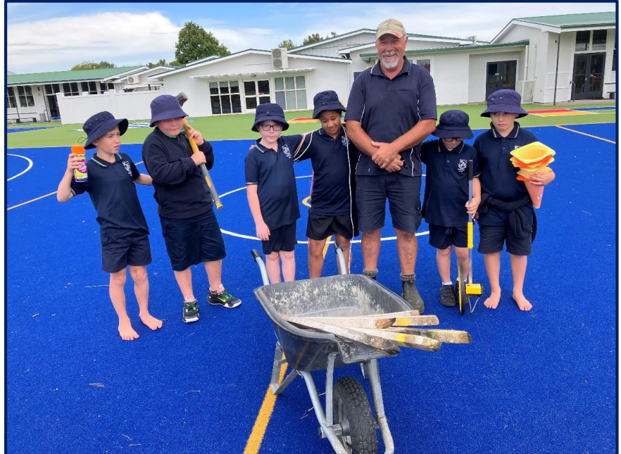
Our students are gearing up for Athletics Day, which is fast approaching. Students from Rooms 9 and 10 'helped' Mr Ellen set up our schools 100 metre track and have been putting our long jump pit to good use.