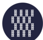
ROIMATA TOROA TEAM